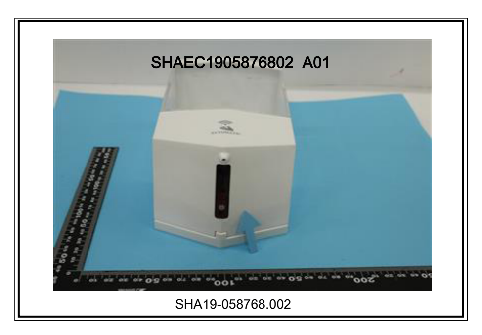
SGS authenticate the photo on original report only *** End of Report ***

No. SHAEC1905876802 A01 Date: 08 Apr 2019 Page 6 of 6