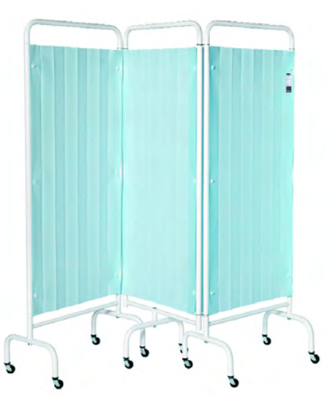
Code: Sun-MFS3/DC Three section screen with disposable curtain

Designed to provide a temporary or mobile privacy solution, and assist in reducing cross infection, our range of folding screens incorporate our unique disposable curtain system in 4 colours and are functional, durable and easy to clean.