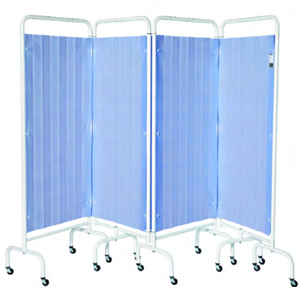
Code: Sun-MFS4/DC Four section screen with disposable curtain