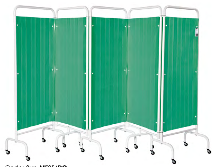
Code: Sun-MFS5/DC Five section screen with disposable curtain