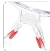
3 positions B FLEX nose