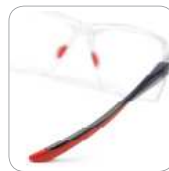
Bi-color & bi-material temples