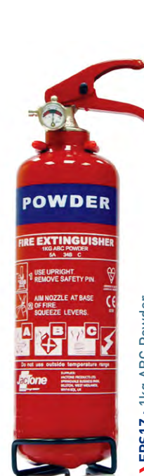
› EPS1Z : 1kg ABC Powder