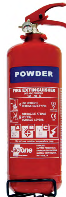
› EPS2Z : 2kg ABC Powder